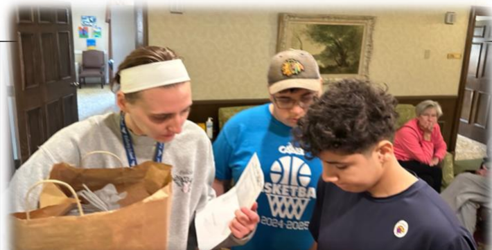
Students and Staff pass out Mother's Day Greetings at Whitehall Sr. Center