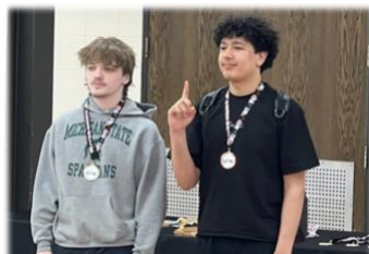
CAAEL award recipients from the basketball tournament

The 2024-25 academic year provided opportunities and success for Felicity students who participated in the Chicago Area Alternative Education League (CAAEL). This organization mission is “to empower students and teachers in alternative schools by integrating athletic and academic programs into the school day, fostering personal growth and responsibility”, and Felicity took advantage of the offerings. Students participated in activities like basketball, art, chess, volleyball, kickball, and more. We are proud not only of the championship basketball team, but all the students earned the chance to participate through school attendance, academic progress and appropriate behavior. Well done!