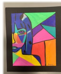
Award winning art work from the CAAEL Art Fair