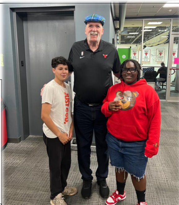
Bill Wennington spends time with Felicity students