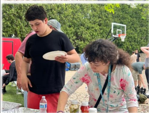
Students and staff enjoy a lunch picnic with games and activities