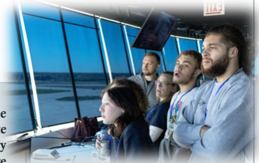
Felicity students enjoy a behind the scenes tour of the control towers at O’Hare Airport.