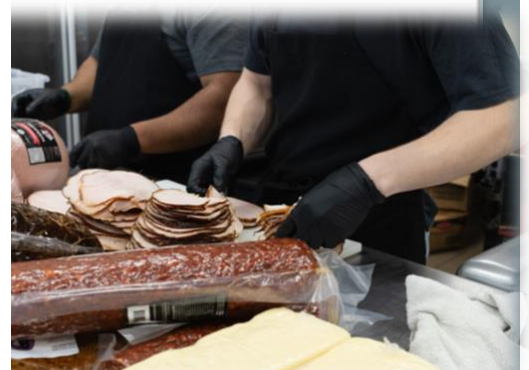
Students prepare for the creation of high-quality grab and go sandwiches.

money for their time, earn credit when appropriate, and prepare for work beyond the comforts of our school. To officially join the kitchen staff, students work with a job coach, craft resumes, pass a food safety course, and train specifically for the kitchen. This new model for transition services enables students to have their first work experience in a safe and friendly environment while developing skills that will immediately transfer to other future jobs and work environment.